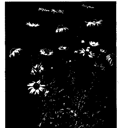
Bright yellow disk flowers are encircled by white ray flowers that appear as a fringe of 20 to 30 petals.

Oxeye daisy is an herbaceous perennial, 1 to 3 feet tall, with shallow, branched rhizomes. The stems, which arise from upturned rhizomes or buds on the root crown, range from hairless to slightly hairy. Stems at the base of the plant grow flat along the ground and can root. Other stems grow upright and can be simple to slightly branched.